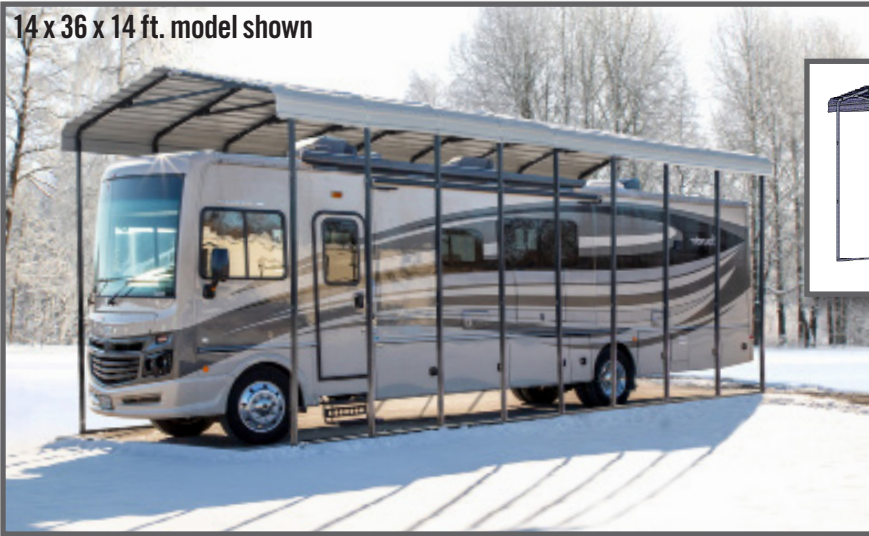
14 x 36 x 14 ft. model shown

Multi-use shelter and carport – Perfect for storing larger vehicles like Class A RV's, tractors, and boats.