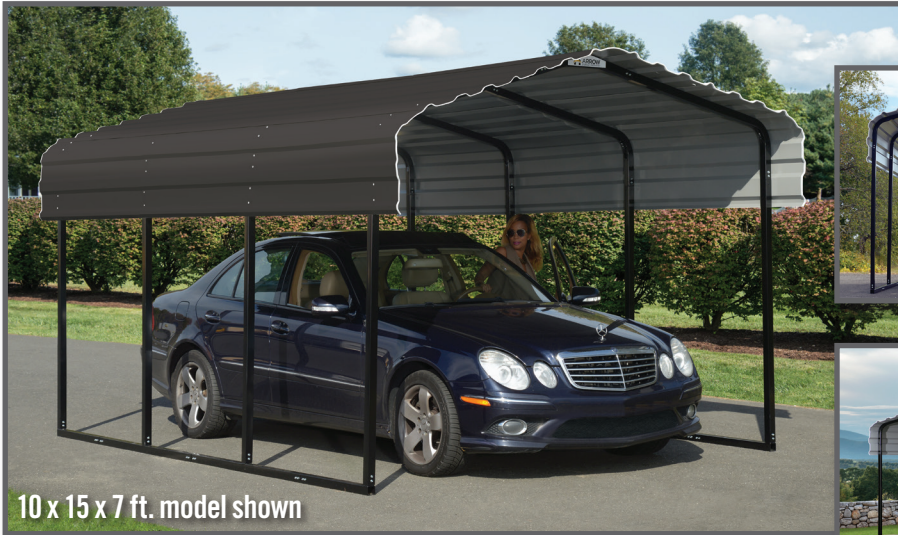
10 x 15 x 7 ft. model shown