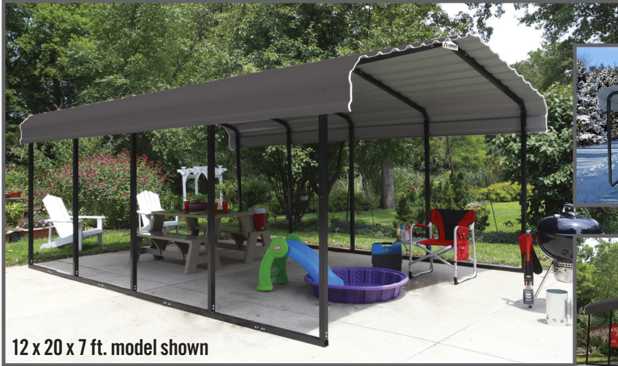
12 x 20 x 7 ft. model shown

Multi-use shelter and carport – perfect for vehicles, boats, tractors, and outdoor picnic areas and patio furniture.